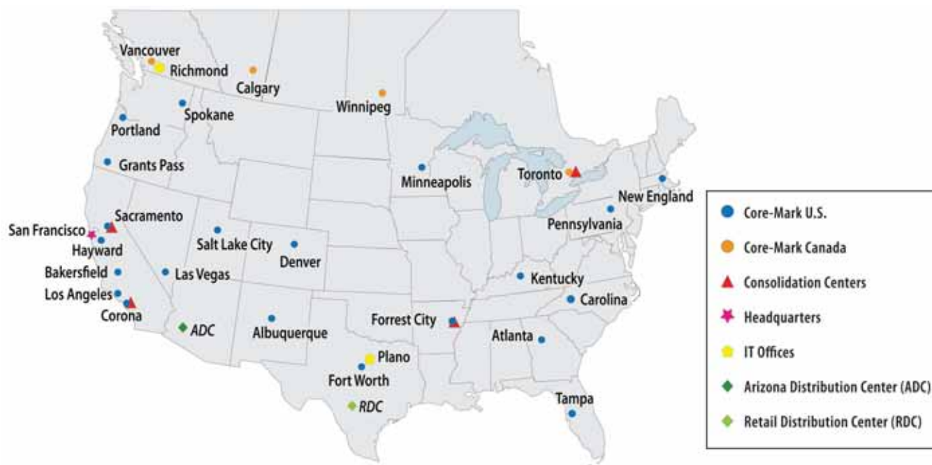
Map of Operations

We operate four consolidation centers, including one that opened in Toronto, Canada in the fourth quarter of 2013, which buy products from our suppliers in bulk quantities and then distribute the products to many of our other distribution centers. The products purchased by our consolidation centers include frozen and chilled items, health and beauty care and general merchandise products. The new center in Toronto was launched with an exclusive distribution arrangement with a retail beverage manufacturer. We expect to obtain additional consolidated purchasing opportunities for Canada in 2014. We operate two additional facilities as a third party logistics provider. One distribution facility located in Phoenix, Arizona, referred to as the Arizona Distribution Center (“ADC”), is dedicated solely to supporting the logistics and management requirements of one of our major customers, Couche-Tard. The second distribution facility located in San Antonio, Texas, referred to as the Retail Distribution Center (“RDC”), is dedicated solely to supporting another major customer, CST Brands, Inc. (formerly, Valero Energy Corporation).